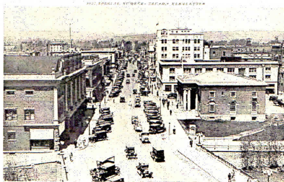
Downtown Reno in the 1920s

These two colorful history buffs will enlighten us about Reno's